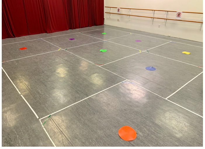
Each box has color coded corners to help dancers follow directions and has an X.